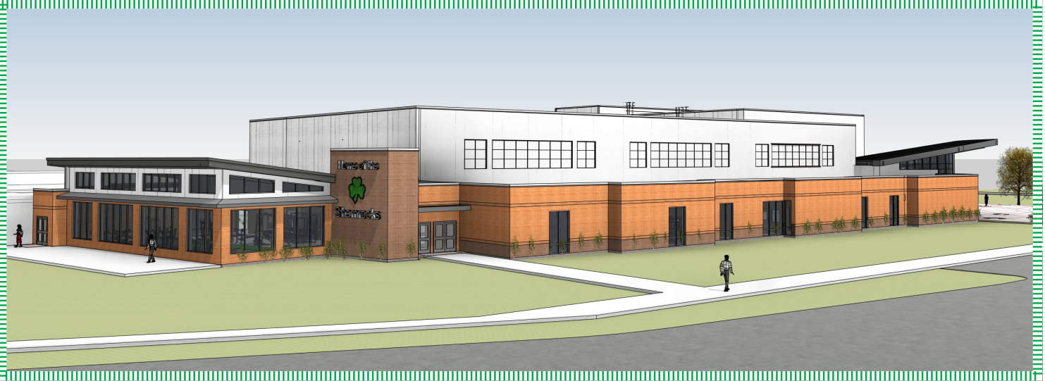
These are the renditions of the finished Arts and Athletic Center provided by the CARMI Design Group.